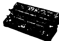
Series 2/3 Toner Cartridge HP/Apple/Canon Laser Printers #140195A

Ad Special Lexmark Toner Cartridges for HP Printers