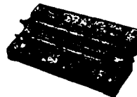
Series 2/3 Toner Cartridge HP/Apple/Canon Laser Printers #140195A