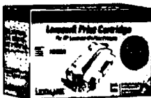
Series 4 Toner Cartridge HP/Apple/Canon Laser Printers #140198A