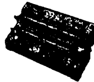
Series 2/3 Toner Cartridge HP/Apple/Canon Laser Printers #140195A