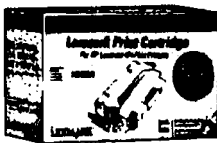
Series 4 Toner Cartridge HP/Apple/Canon Laser Printers #140198A