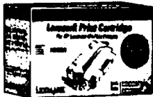
Series 4 Toner Cartridge HP/Apple/Canon Laser Printers #140198A