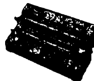
Series 2/3 Toner Cartridge HP/Apple/Canon Laser Printers #140195A