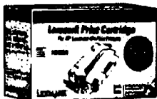
Series 4 Toner Cartridge HP/Apple/Canon Laser Printers #140198A