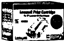
Series 4 Toner Cartridge HP/Apple/Canon Laser Printers #140198A