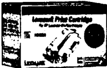
Series 4 Toner Cartridge HP/Apple/Canon Laser Printers #140198A