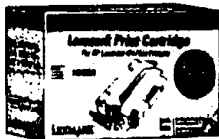
Series 4 Toner Cartridge HP/Apple/Canon Laser Printers #140198A