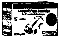
Series 4 Toner Cartridge HP/Apple/Canon Laser Printers #140198A