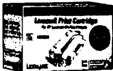
Series 4 Toner Cartridge HP/Apple/Canon Laser Printers #140198A