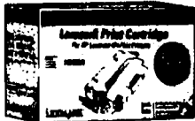
Series 4 Toner Cartridge HP/Apple/Canon Laser Printers #140198A