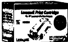
Series 4 Toner Cartridge HP/Apple/Canon Laser Printers #140198A