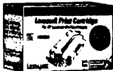
Series 4 Toner Cartridge HP/Apple/Canon Laser Printers #140198A