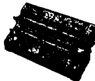
Series 2/3 Toner Cartridge HP/Apple/Canon Laser Printers #140195A