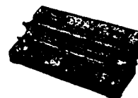
Series 2/3 Toner Cartridge HP/Apple/Canon Laser Printers #140195A

Ad Special Lexmark Toner Cartridges for HP Printers